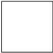
1" Test Square